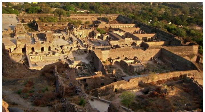
The vestiges of Golconda today

The reserves of these mines have long since been depleted and only the vestiges still remain to bear witness to their former grandeur.