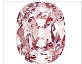
Princie Diamond (34.65 ct) Fancy Intense Pink

According to Indian tradition, the Nizam had pre-emption rights for the most beautiful diamonds from the Golconda mine. It was believed at the time that a stone's interior energy was transmitted to its owner.