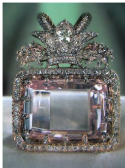
Darya-i-Nur (186.00 ct) Light Pink

The Golconda mines are known for their particularly beautiful natural coloured diamonds which possess unusual colour and remarkable transparency. The three largest pink diamonds, the Darya-i Nur , the Nur-ul-Ain and the Princie Diamond all come from these mines.